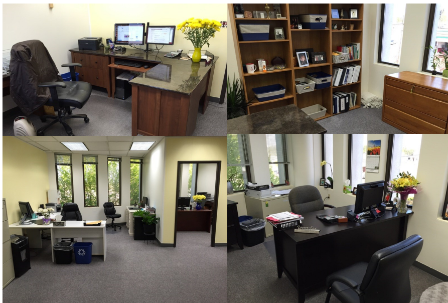
The new HHD office space in Burien!